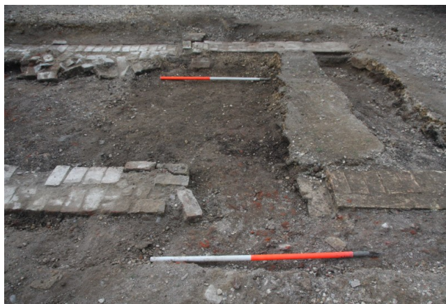
North east corner of A from south showing vertical pipe [10] and pipe [9] entering duct on north side of wall [3]